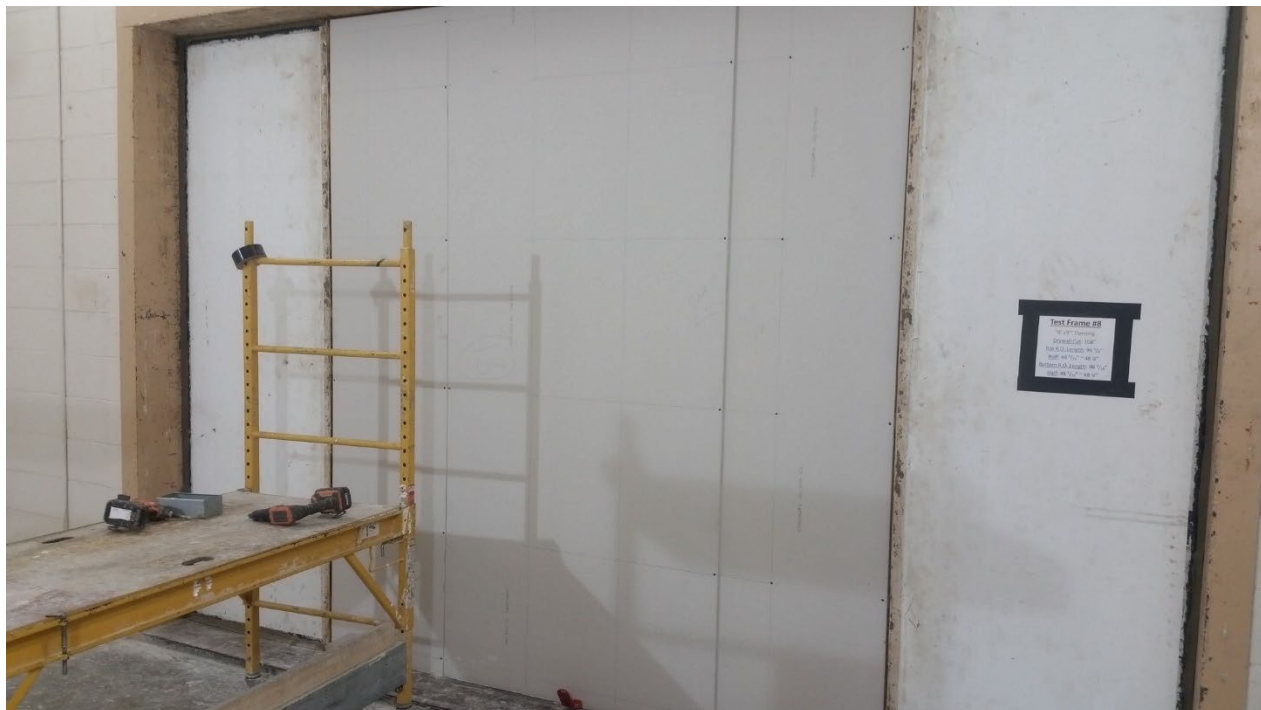
Figure 6 – Source room side face layer gypsum partially installed, viewed from source room side