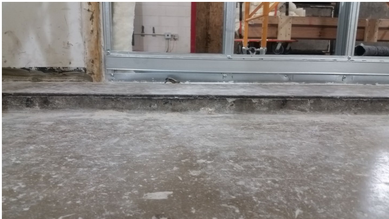
Figure 4 – Detail of studs fastened to track, and resilient channel fastened to studs