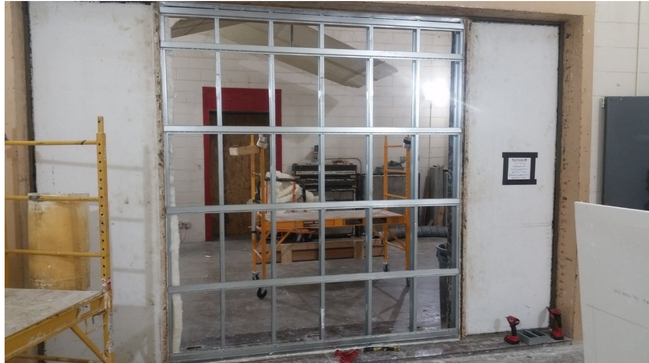
Figure 3 – Tracks, stud, and resilient channel installed in test aperture, viewed from source room side