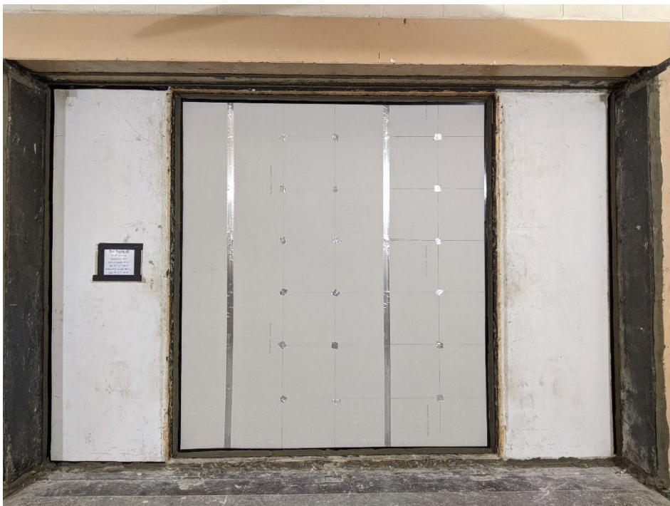
Figure 2 – Specimen mounted in test aperture, as viewed from receive room