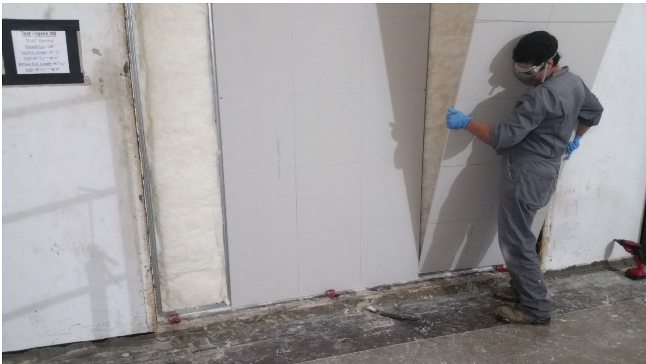
Figure 8 – Receive room side gypsum partially installed, viewed from receive room