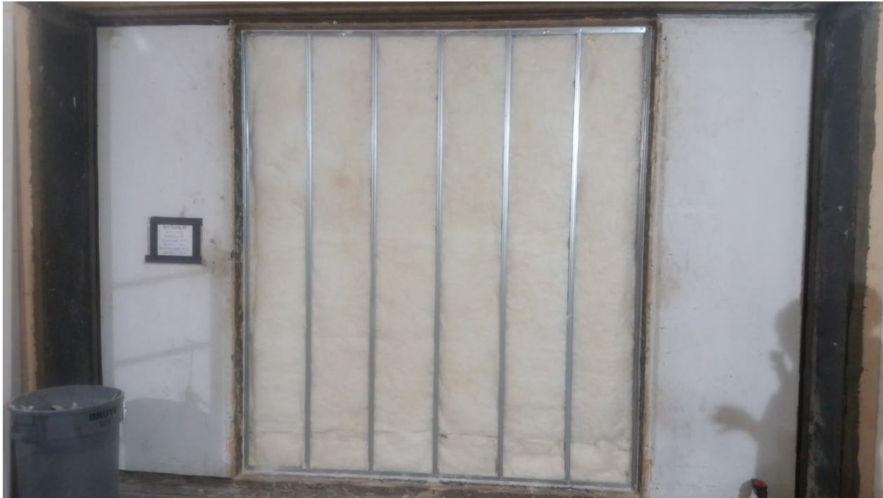
Figure 7 – Insulation installed in stud cavities, viewed from receive room