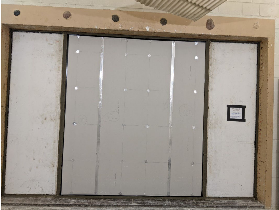
Figure 1 – Specimen mounted in test aperture, as viewed from source room