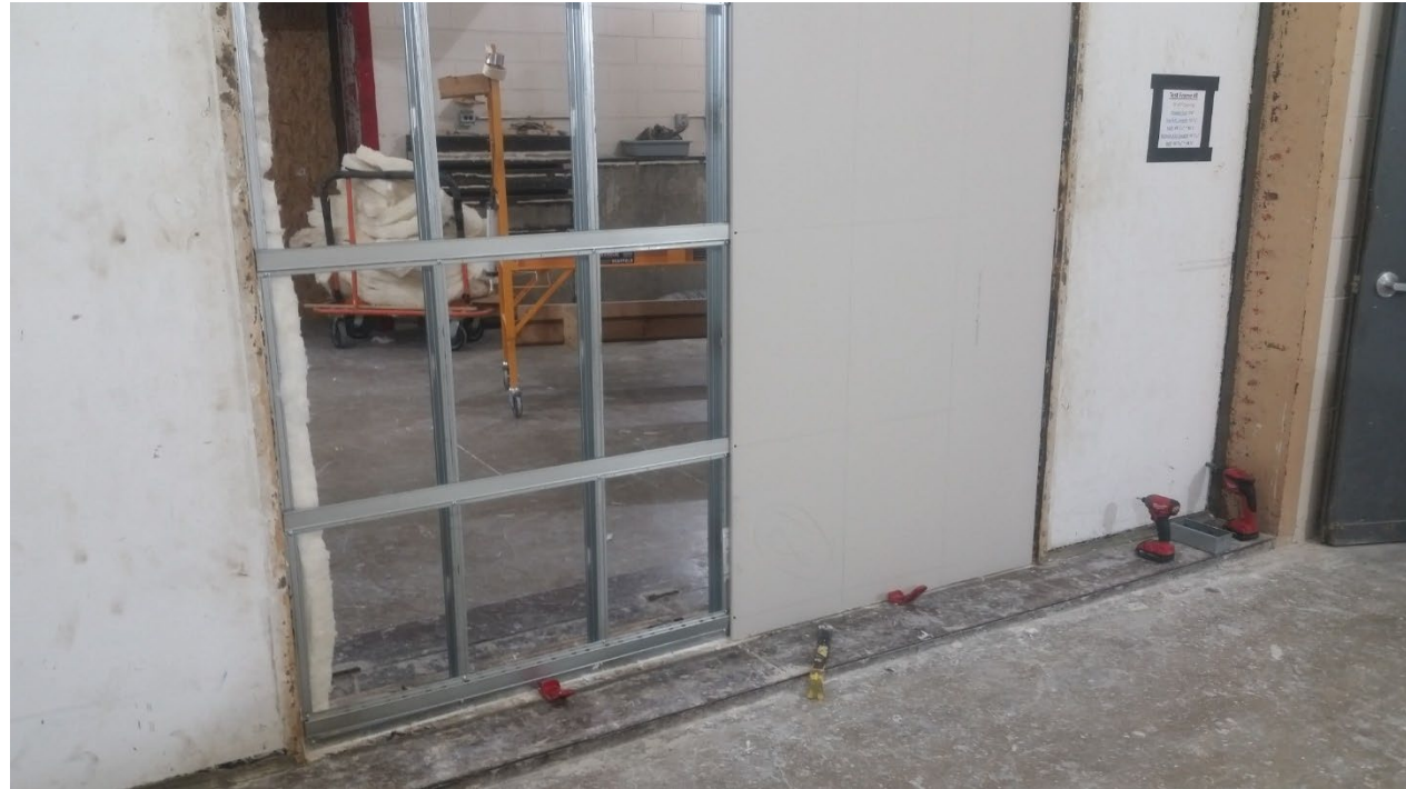
Figure 5 – Source room side base layer gypsum partially installed, viewed from source room side