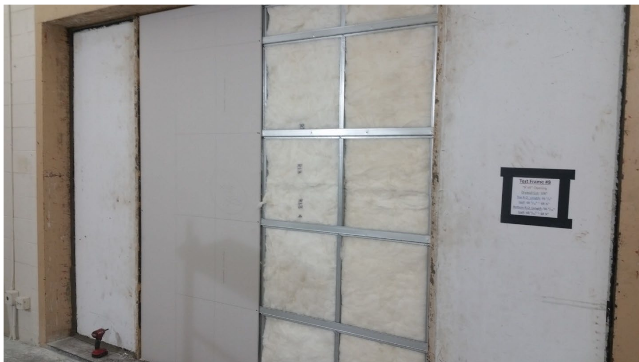
Figure 6 – Source room side base layer gypsum partially installed