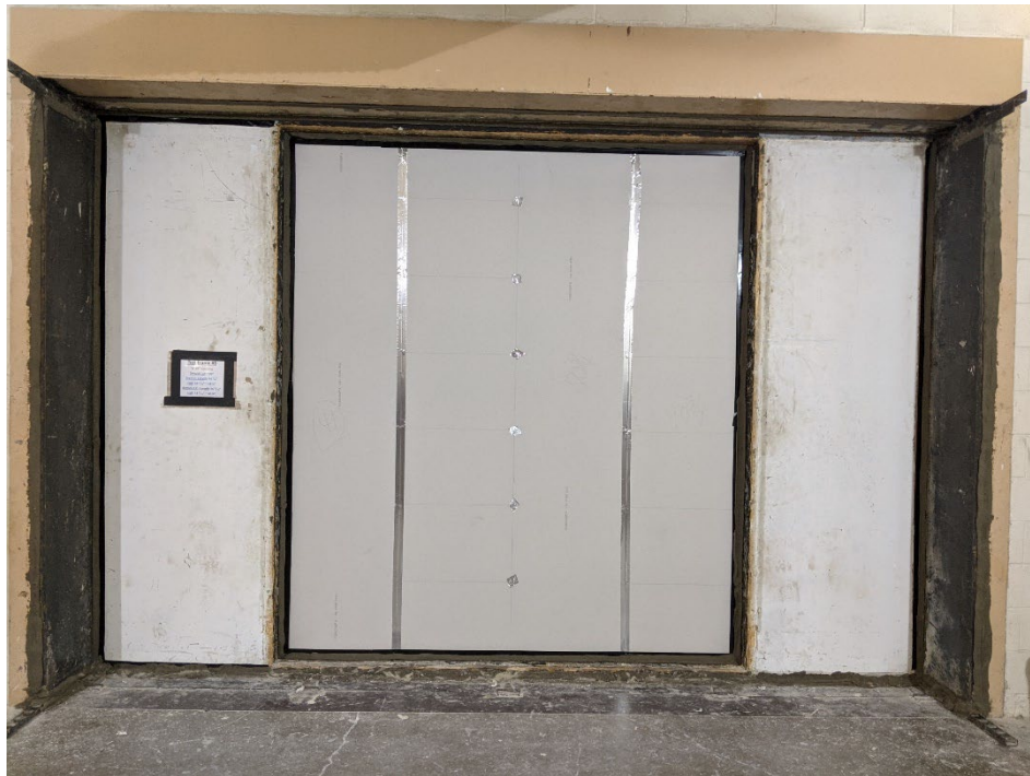
Figure 2 – Specimen mounted in test aperture, as viewed from receive room