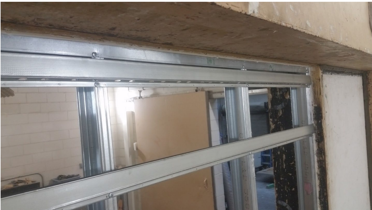
Figure 4 – Detail of studs fastened to track and resilient channel fastened to studs