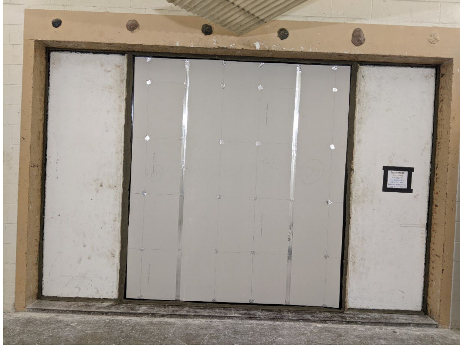
Figure 1 – Specimen mounted in test aperture, as viewed from source room