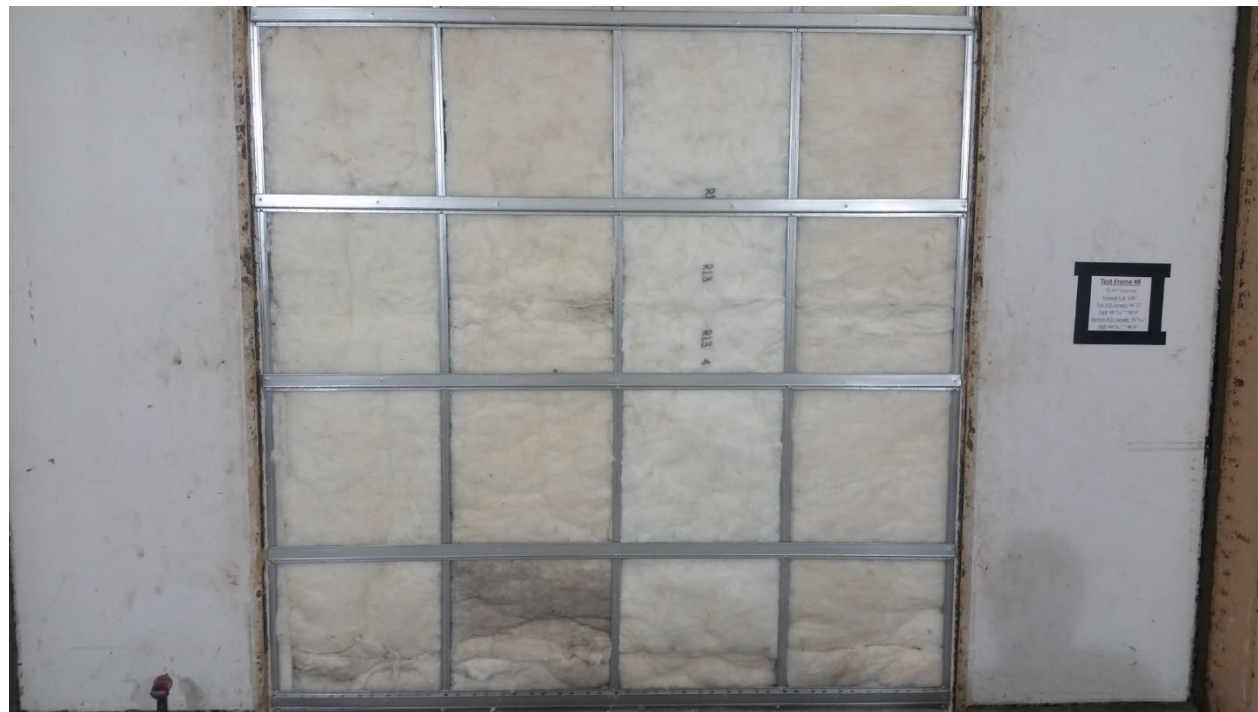
Figure 5 – Insulation installed in stud cavities, viewed from source room side