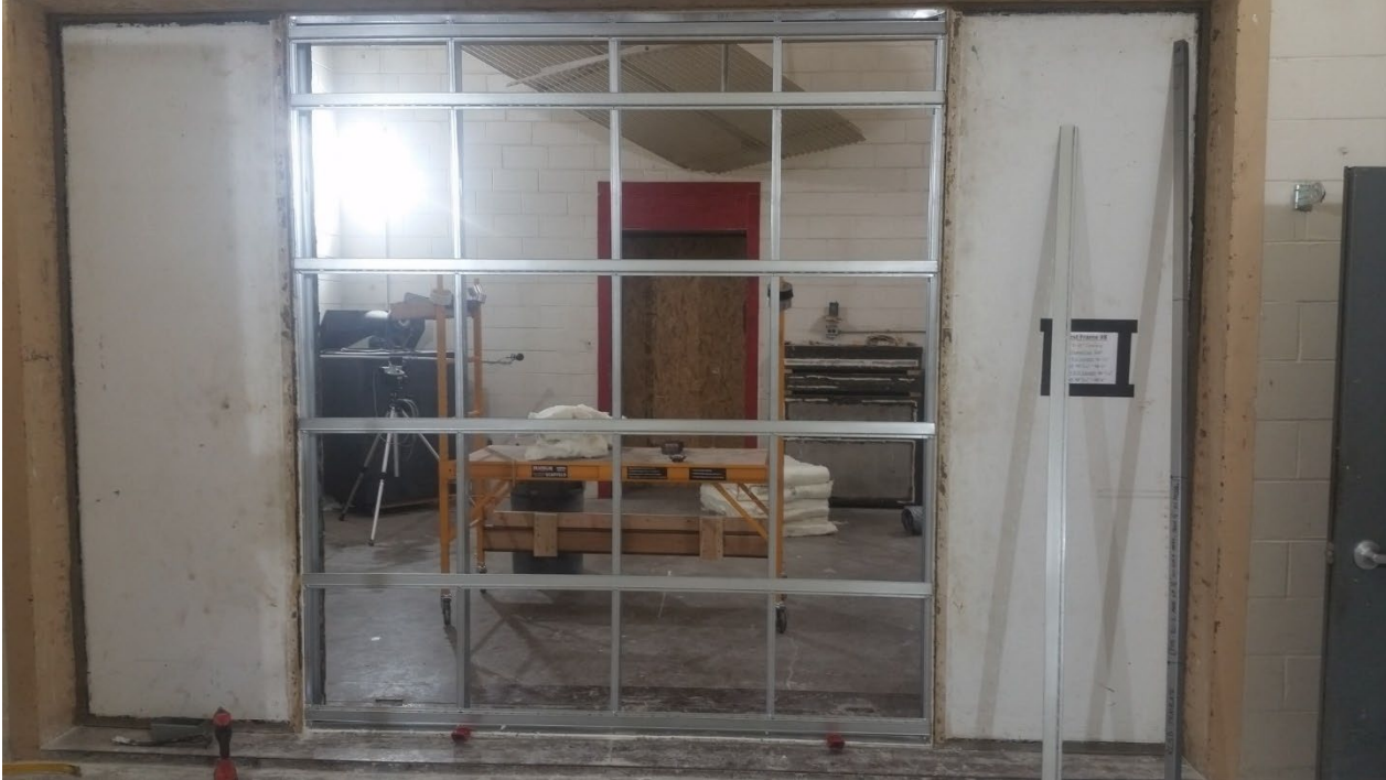
Figure 3 – Tracks, studs, and resilient channel installed in test aperture, view from source room side