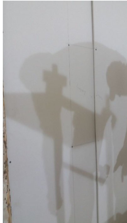
Figure 7 – Source room side face layer partially installed