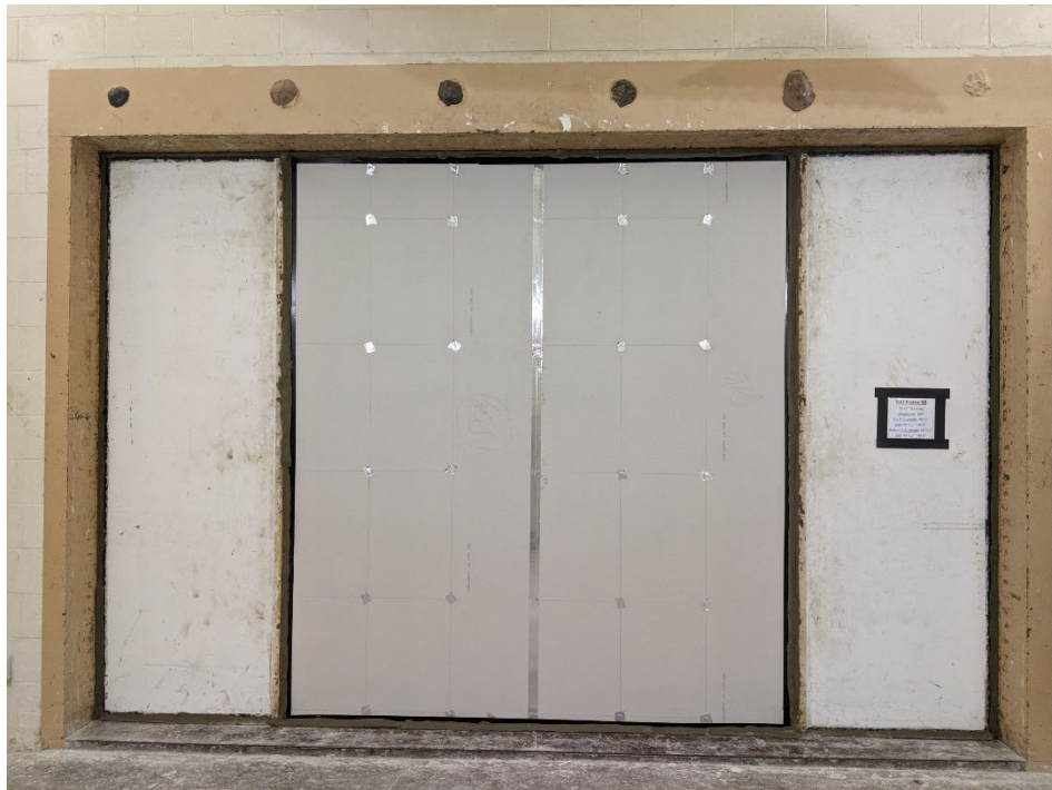
Figure 1 – Specimen mounted in test aperture, as viewed from source room

FOUNDED 1918 BY WALLACE CLEMENT SABINE RAL™-TL24-434 Page 5 of 13