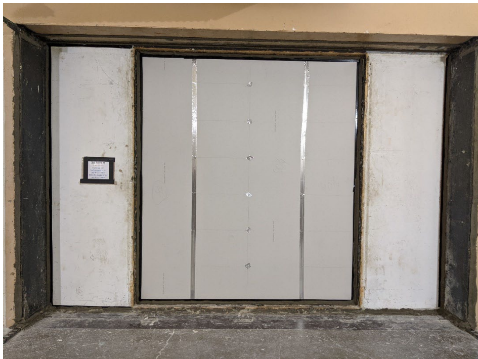
Figure 2 – Specimen mounted in test aperture, as viewed from receive room