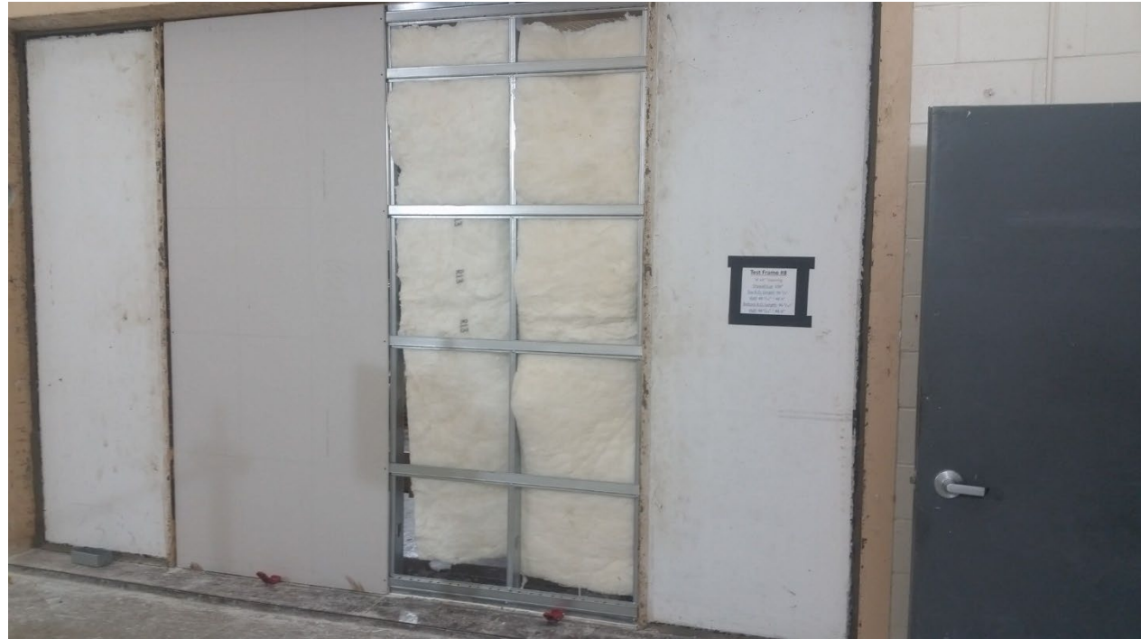
Figure 5 – Insulation partially installed in stud cavities, source room side gypsum partially installed