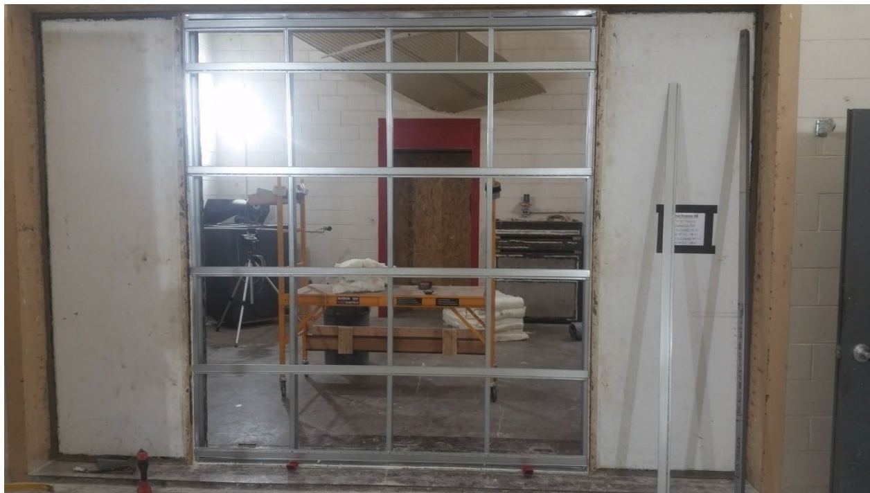
Figure 3 – Tracks, studs, and resilient channel installed in test aperture, view from source room side