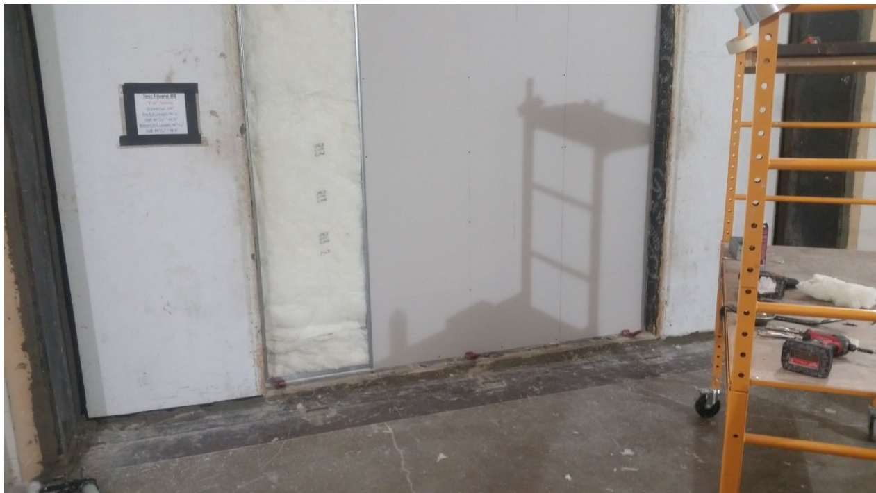
Figure 6 – Insulation installed, receive room side gypsum partially installed, view from receive room