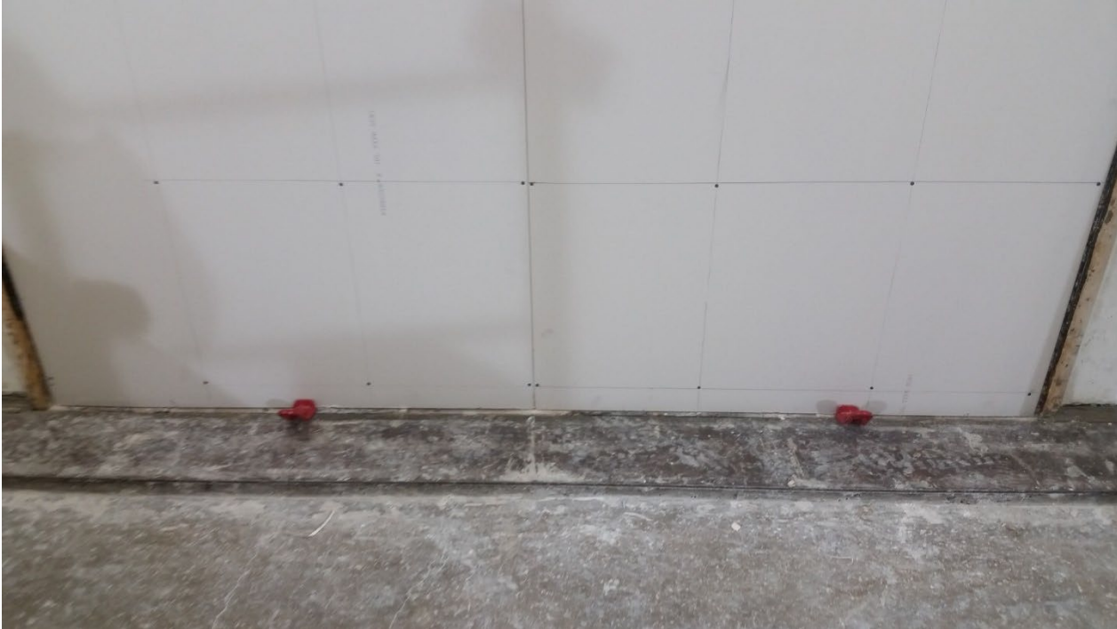
Figure 5 – Source room side base layer gypsum installed, view from source room side