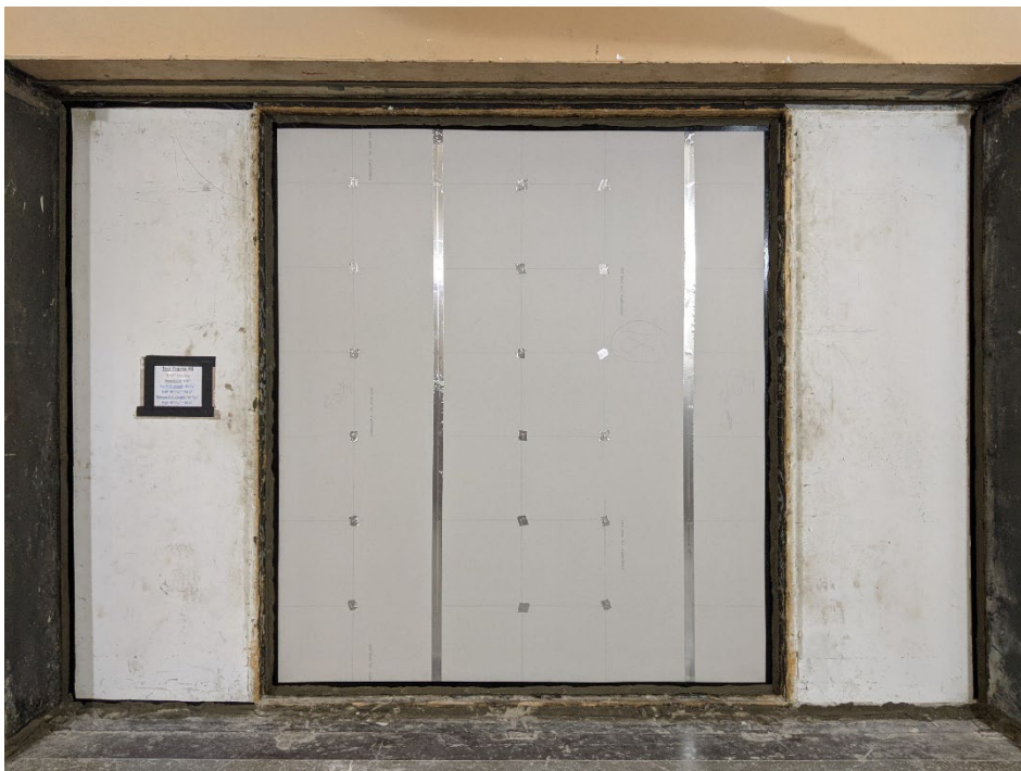
Figure 2 – Specimen mounted in test aperture, as viewed from receive room