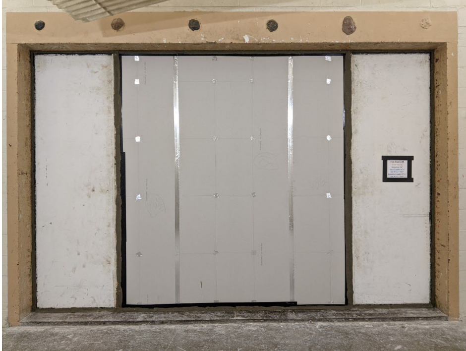
Figure 1 – Specimen mounted in test aperture, as viewed from source room