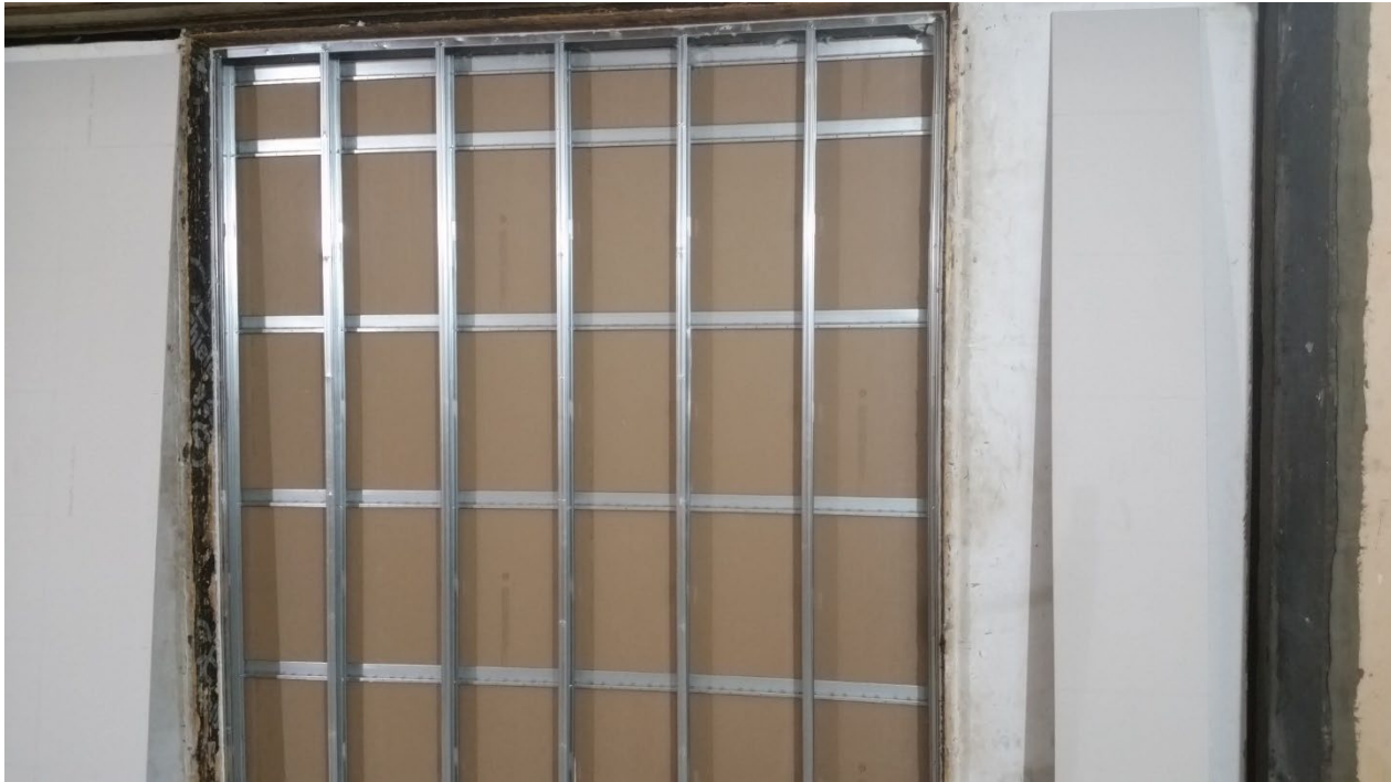
Figure 3 – Tracks, studs, resilient channel, and source side base layer gypsum installed, view from receive room