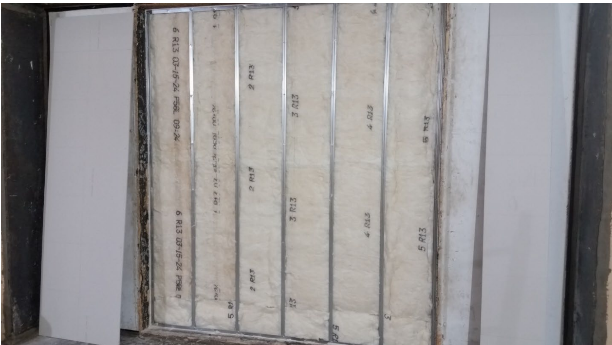
Figure 6 – Insulation installed in stud cavities, view from receive room side