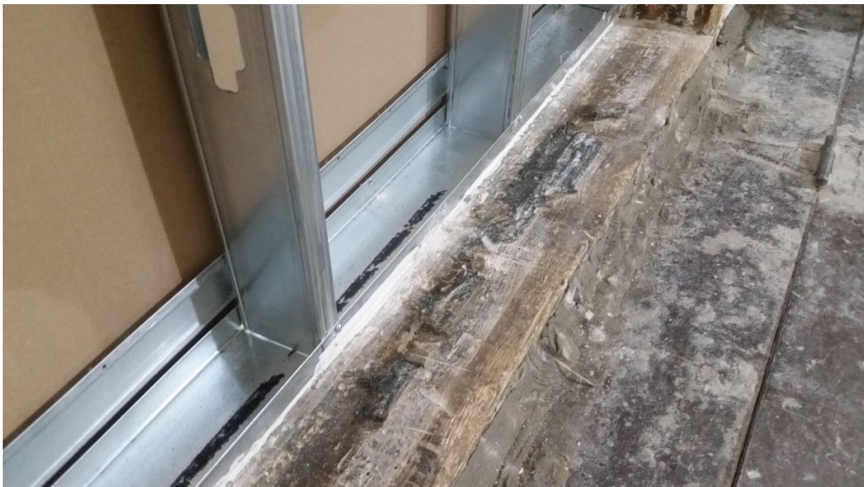
Figure 4 – Detail of studs fastened to track