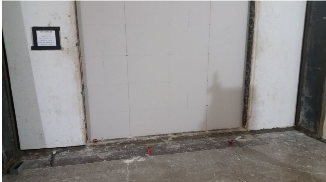
Figure 9 – Base layer receive side gypsum board installed, as viewed from receive room side