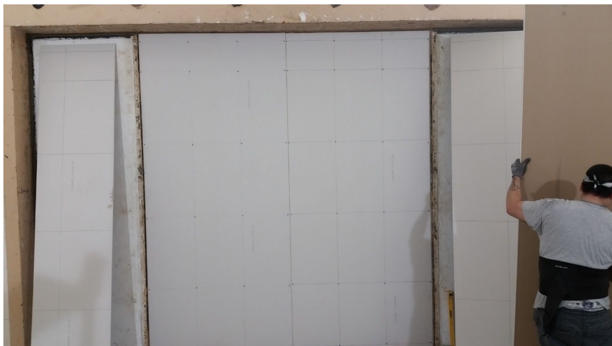
Figure 6 – Base layer of source room side gypsum board installed, as viewed from source room