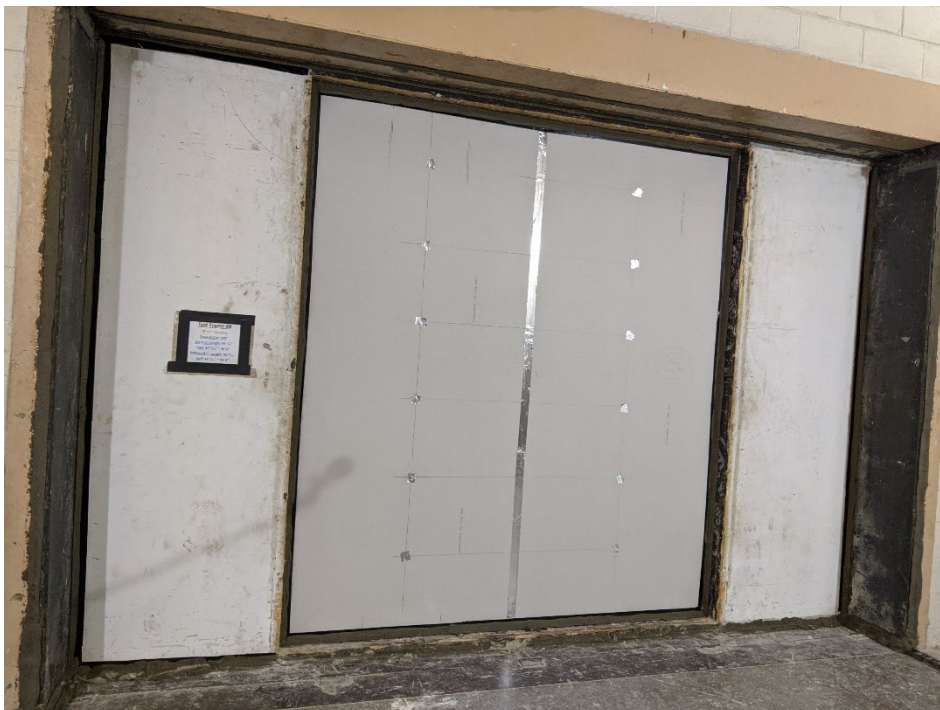
Figure 2 – Specimen mounted in test aperture, as viewed from receive room