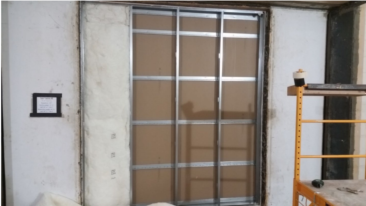
Figure 7 – Source room side gypsum installed, insulation partially installed, viewed from receive room side