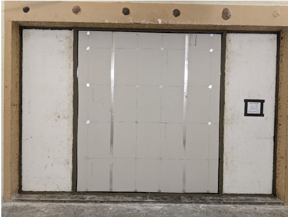
Figure 1 – Specimen mounted in test aperture, as viewed from source room