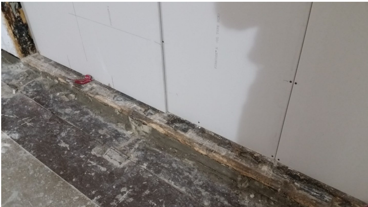
Figure 10 – Face layer receive side gypsum board partially installed, as viewed from receive room side