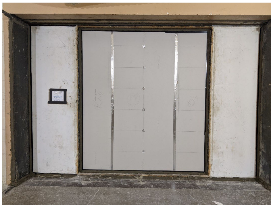
Figure 2 – Specimen mounted in test aperture, as viewed from receive room