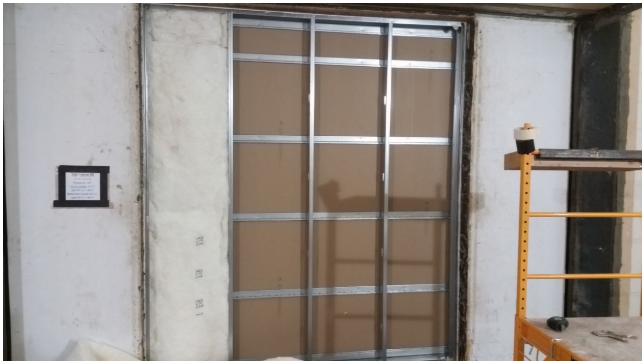
Figure 6 – Source room side gypsum installed, insulation partially installed, viewed from receive room side