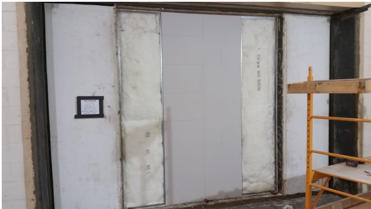
Figure 8 – Gypsum board partially installed on receive room side of studs