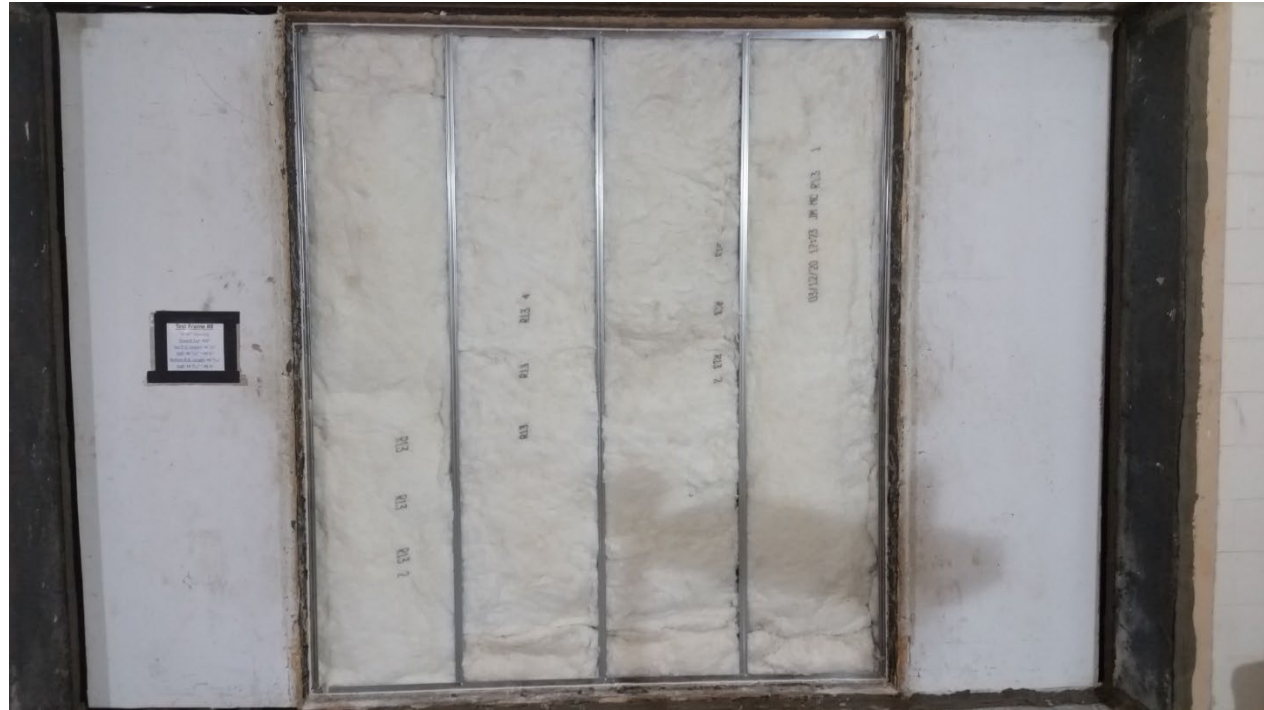
Figure 7 – Insulation installed in stud cavities, viewed from receive room side