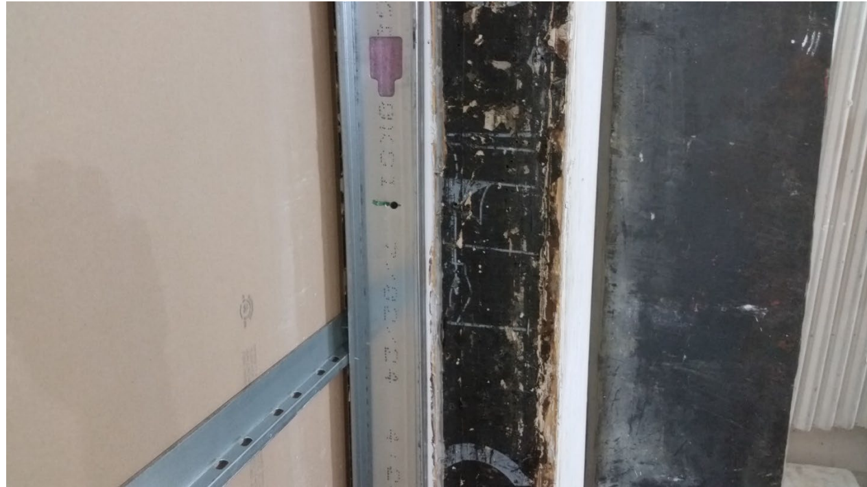
Figure 5 – Detail of side stud fastened to test frame, viewed from receive room side