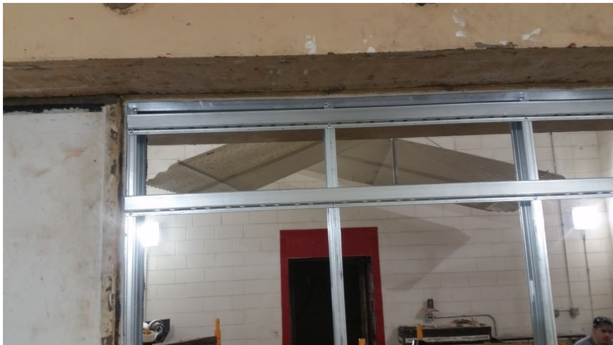
Figure 4 – Detail of resilient channel installed to studs, viewed from source room side