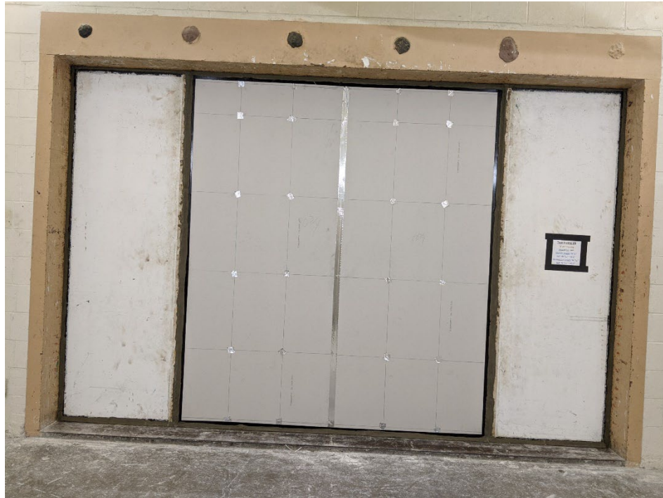
Figure 1 – Specimen mounted in test aperture, as viewed from source room