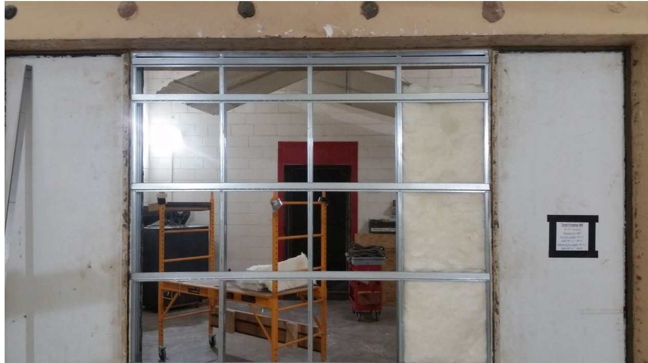
Figure 3 – Tracks, studs, and resilient channel installed in test aperture, insulation partially installed